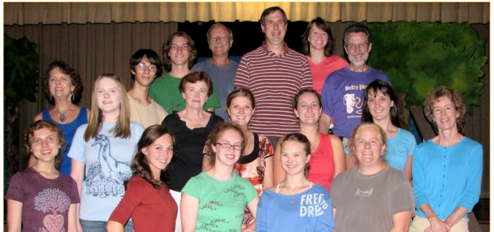
Second Broadway Cabaret Cast